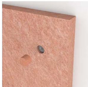
Concealed mechanical fasteners